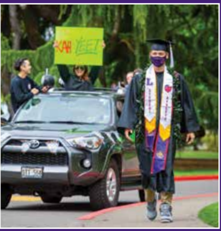
See full gallery at linfield.edu/magazine

Summer 2021 | Linfield Magazine - 10 Summer 2021 | Linfield Magazine - 11