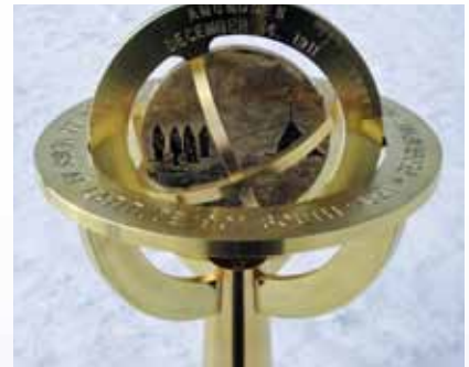
South Pole marker, dedicated in January 2012.

The 2011-12 summer season also happened to coincide with the 100-year anniversary of Roald Amundsen and Robert Falcon Scott first reaching the South Pole. This was a big deal at our tiny, remote community. Jens Stoltenberg, the prime minister of Norway, along with his cabinet and entourage, spent several days at the station, giving speeches, holding ceremonies and casually cross-country skiing across the polar plateau. On the anniversary proper, Mr. Stoltenberg stood at the pole marker and gave an incredibly moving speech, honoring the spirit of exploration, international collaboration