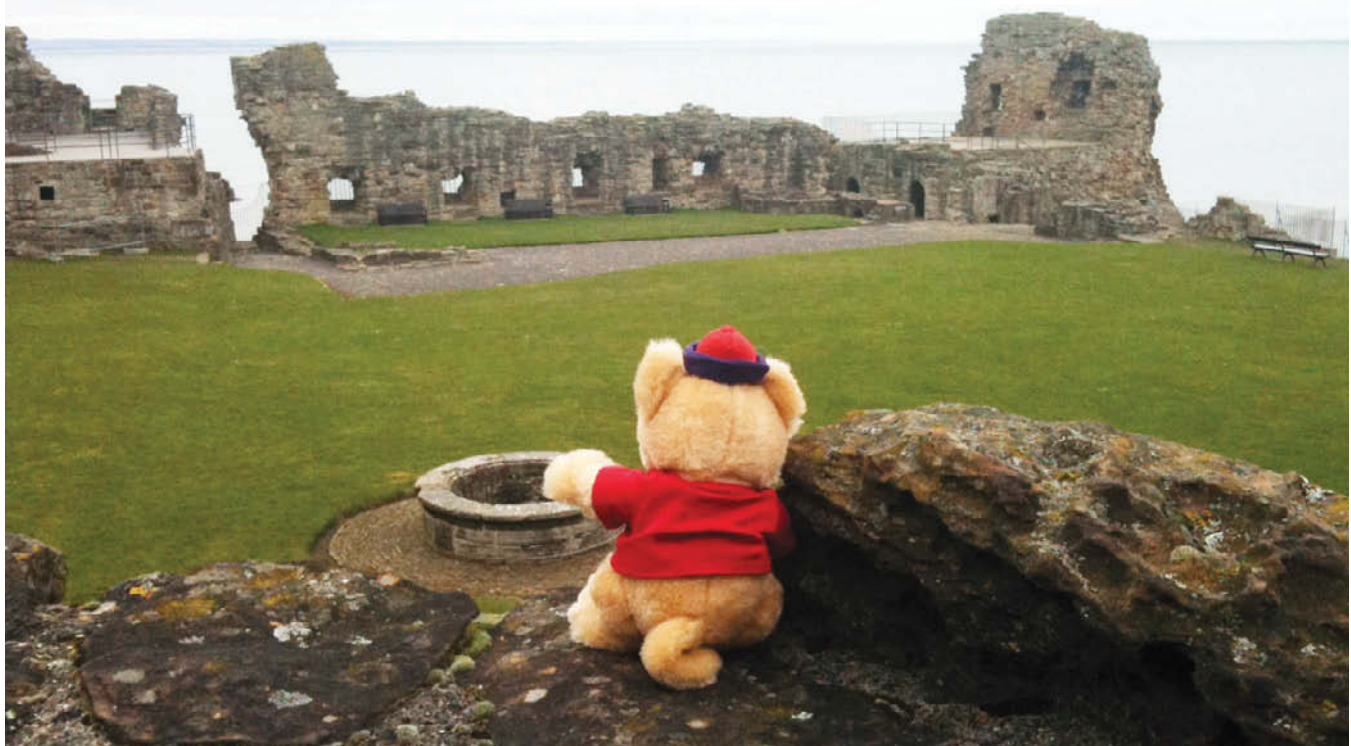
The Wildcat looks out from St. Andrews Castle.