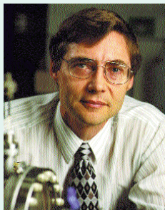
Carl E. Wieman

Carl E. Wieman, distinguished professor of physics at the University of Colorado at Boulder, will be featured at the Oregon Nobel Laureate Symposium at Linfield College.