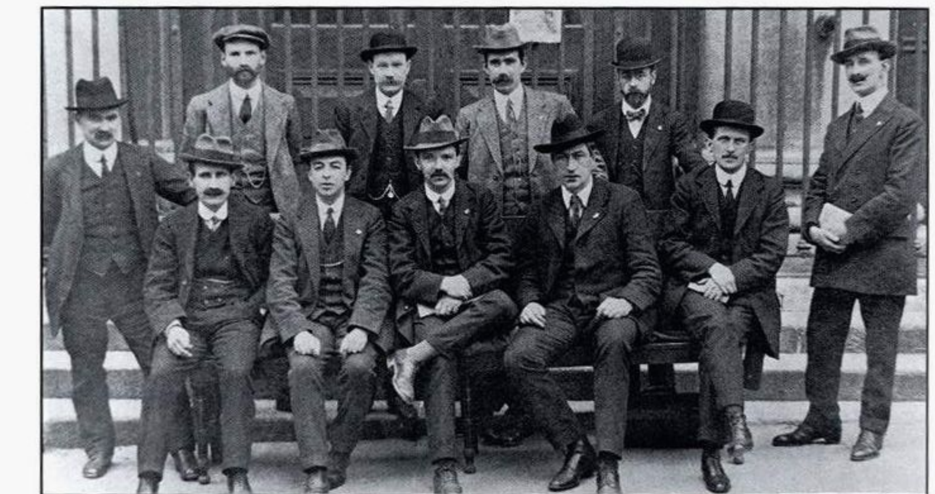
The National Executive of the Irish TUC and Labour Party, 1914

With the IWW Connolly also gained experience organizing workers, striking to achieve better wages, working hours, and conditions. During his time in America, he refined his organization and strike methods, which he would employ upon return to Ireland in 1910 through his work with the Irish Transport and General Workers Union and other labor organization efforts.