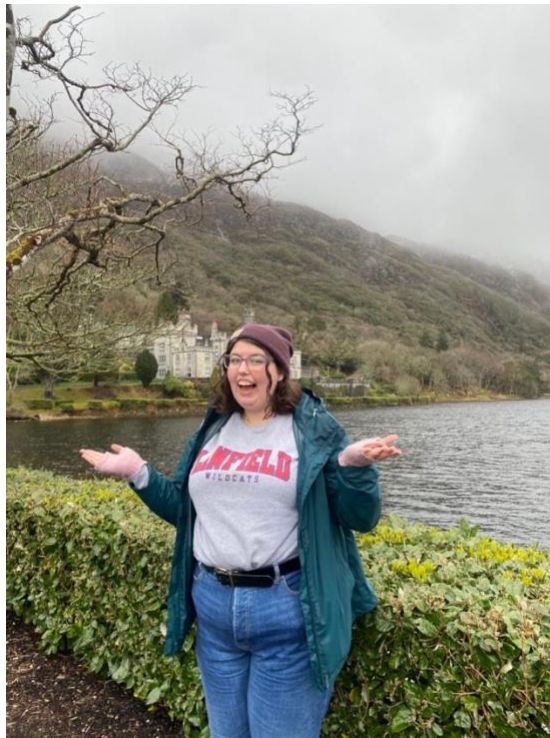
Posing with the Abbey

International Student Society hosts events catered towards international students, both those like me who are visiting for a semester, as well as long term international students. They organized a bus tour to explore the Connemara region north of Galway and it was an amazing trip. We stopped in the village of Cong – famous for being the place where John Wayne filmed The Quiet Man – and Kylemore Abbey, an absolutely beautiful castle turned Abbey that doubles as a museum/tourist destination.