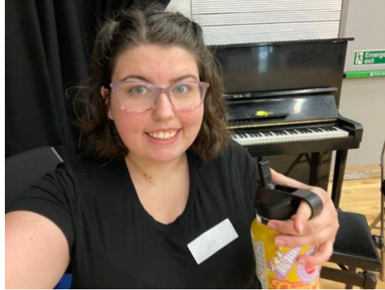
Me at auditions

International Student Society hosts events catered towards international students, both those like me who are visiting for a semester, as well as long term international students. They organized a bus tour to explore the Connemara region north of Galway and it was an amazing trip. We stopped in the village of Cong – famous for being the place where John Wayne filmed The Quiet Man – and Kylemore Abbey, an absolutely beautiful castle turned Abbey that doubles as a museum/tourist destination.