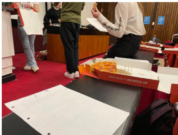
Post-meeting pizza at Lit & Deb! Our workshop of the day was “Frankenstein poems”, where each person completes a different line of the poem.

Lit & Deb functions similarly to the speech and debate program back at Linfield (which I happen to be a member of), so I immediately knew I wanted to get involved. Over the course of the semester I attended weekly public speaking workshops and debate events, culminating in an end of year party the last week of classes.