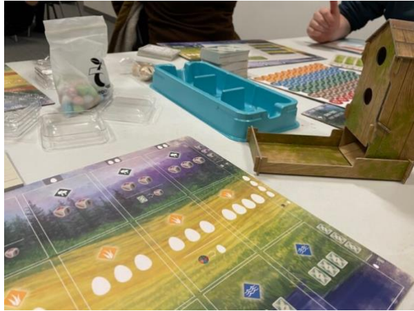
Trying (and failing) to learn how to play Wingspan.

The moral of this post is that there are so many ways to get involved on campus, and your level of involvement in any society could be as little as attending one event a semester or as big as going weekly and taking up a leadership role in the society. Especially going from a smaller university with a limited amount of clubs to one with over 60, there were so many more options when it came to getting involved on campus. Getting involved allowed me to explore new places, meet new people, and try new things. While it may not be as exciting as a travel post, I hope you enjoy this glimpse into my everyday life as a university student in Ireland these past few months 😊