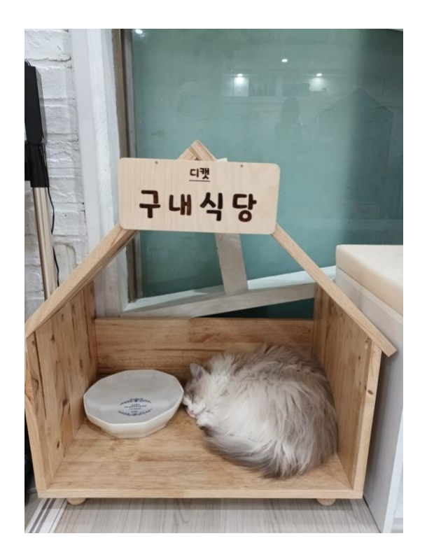
Oh To Be A Cat Sleeping in A Café.

Midterms are this week and next, so I do not think I will do much but focus on class.