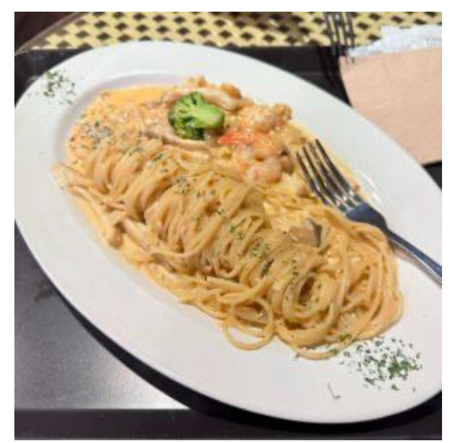
Pasta is The Best!

When we reached the 12th floor there was a beautiful bookstore. Korean book covers are so beautiful. Unfortunately, I am not proficient enough yet to be able to read them. I found a book in English about a fictional Korean family and bought that. We spent 5 hours in that mall and I was glad to finally rest my feet at the end.