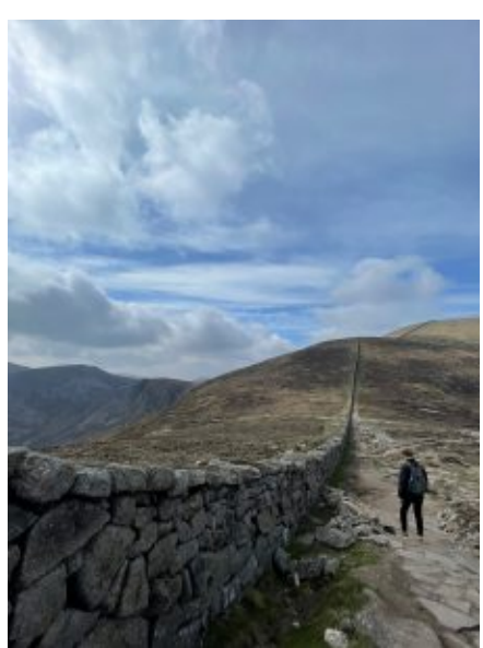
Hiking down Slieve Donard

It was chilly at the top and the view was cluttered by clouds and fog, but of course it was still worth it. From there we hiked all the way back down and explored the little town beneath the mountains until our bus picked us up to return to Belfast.