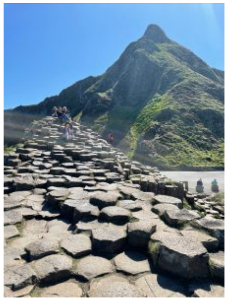
The famous stones

After exploring the area and missing our bus, we decided to walk to Dunluce Castle. This castle is known as the most scenic castle in Northern Ireland. You have to pay a small fee in order to gain access and walk through it, but we opted to take in the view from the hillside.