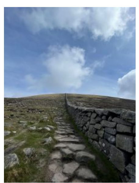
Looking up at Slieve Donard

The clouds came in as we hiked back down, which left us debating whether or not to hike the second mountain, Slieve Donard. This particular mountain happens to be the tallest mountain in Northern Ireland, and while only a couple hundred feet taller than the last, the title itself made it seem more daunting.