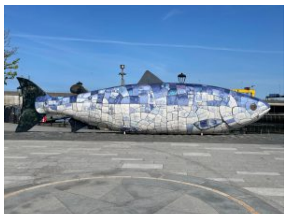
Salmon of Knowledge

I traveled to Belfast by bus and it took around five hours. As soon as I arrived I started exploring the city. I came across the Salmon of Knowledge, the Beacon of Hope, City Hall, and a popular outdoor mall downtown.