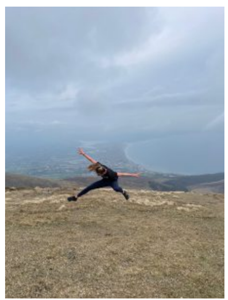
Jumping at the peak

first after a tiresome uphill battle. We celebrated our summit with a lunch break at the top, looking out across the ocean.