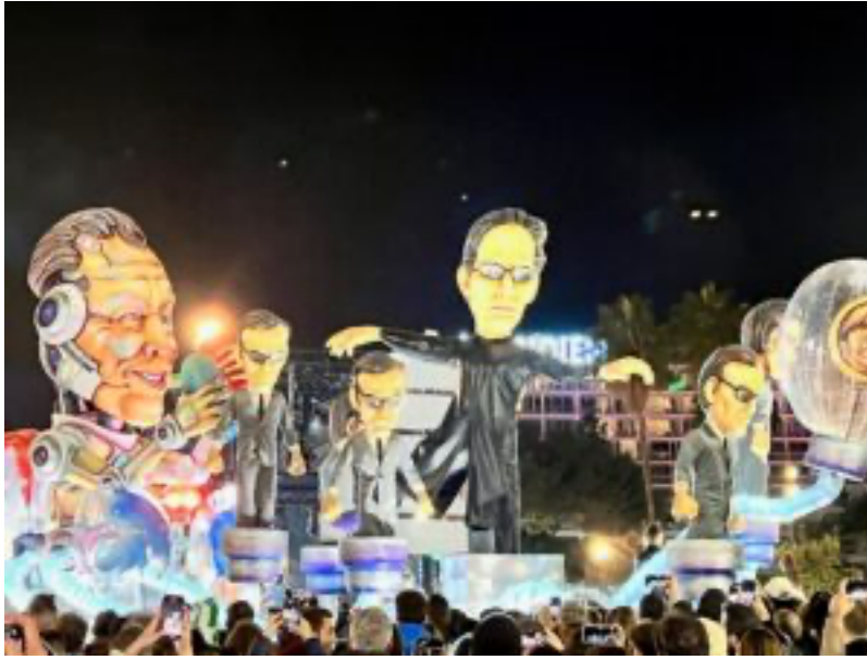
Matrix themed float with Elon

Musk hooked up to machines with the ChatGPT symbol on his chest, holding a red and blue pill.