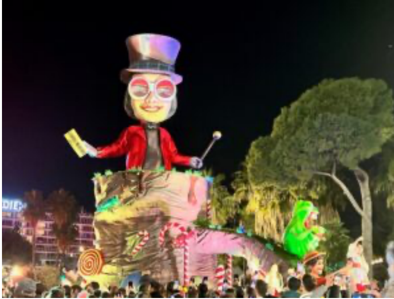
Willy Wonka float