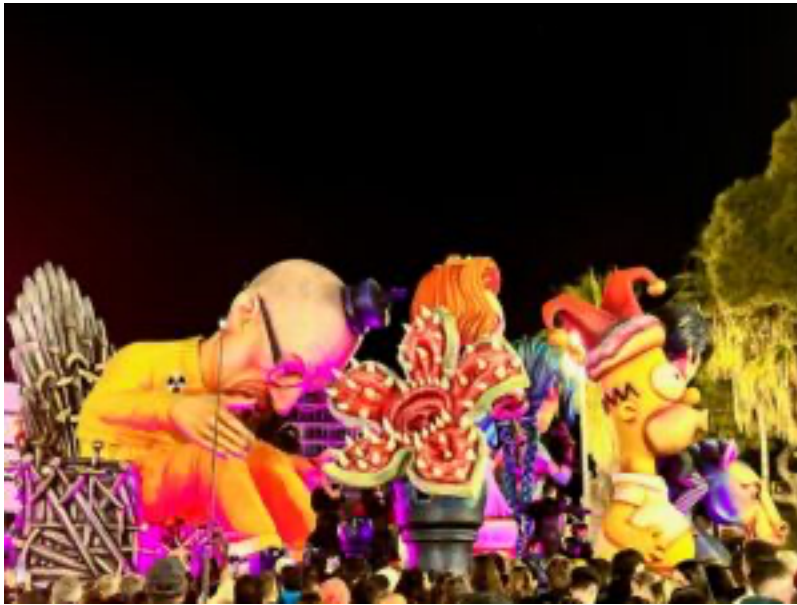
TV show float

Musk hooked up to machines with the ChatGPT symbol on his chest, holding a red and blue pill.