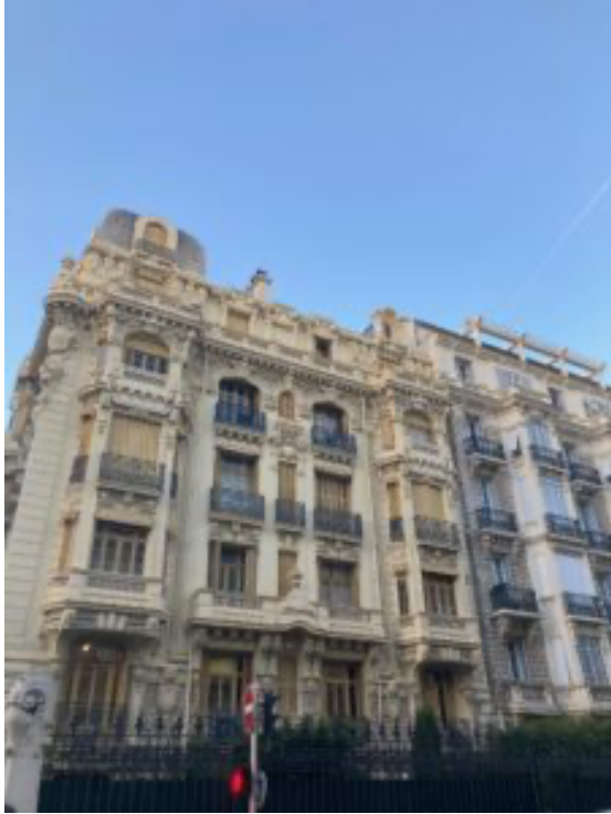
Architecture of Nice

We happened upon an Italian restaurant where we stopped for dinner. It was absolutely amazing!