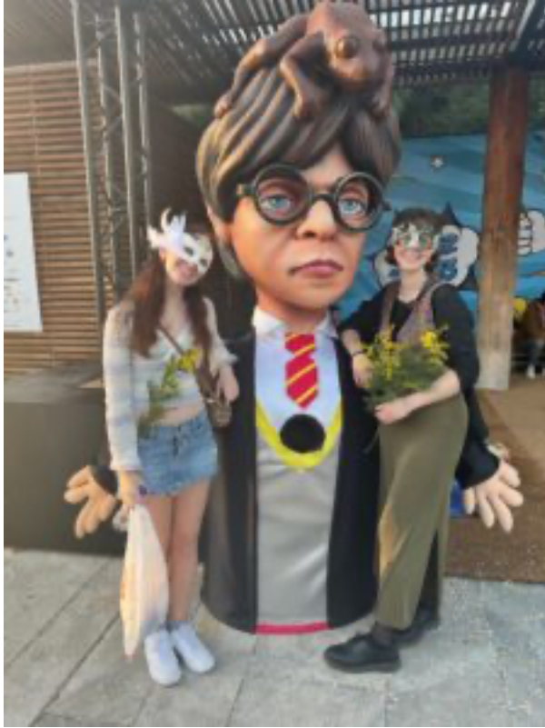
Harry Potter Trash Can

We had a few hours between the opening parade and the parade of lights in the evening. We walked Nice a little more and saw their Notre Dame, a gorgeous cathedral in the center of town.