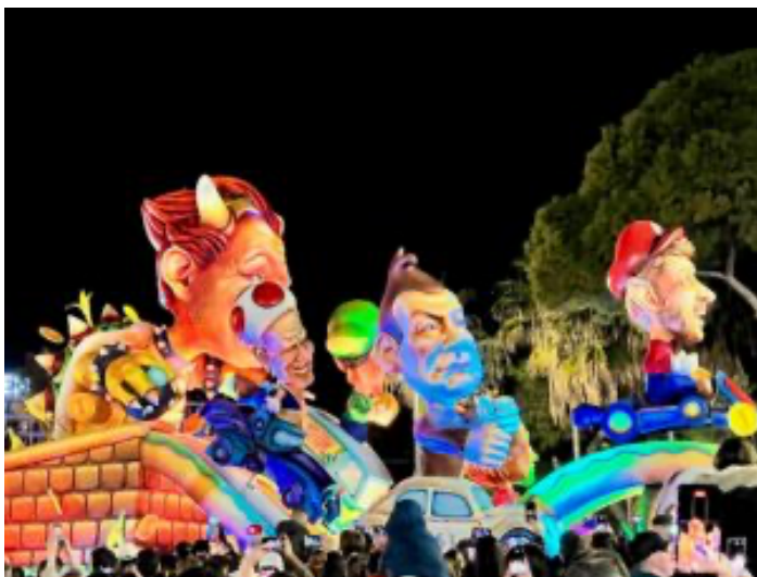
Video game float.

After the sun set, we walked the waterfront down to the Carnival once again, this time for the parade of lights. Still with the pop culture theme, this parade had floats of movies, TV shows, music icons, and social media. They all seemed to be social commentaries as well. It was a very bizarre but amazing experience.