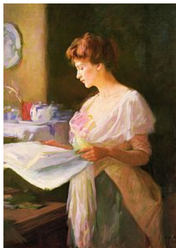
Figure 3. Ellen Day Hale. Morning News , 1905. (Digital Image. Wikimedia Commons. Web. 14 Dec. 2014.)

Hale's painting Morning News (see Figure 3) reflected her evolving vision of women as they gradually freed themselves from traditional expectations.