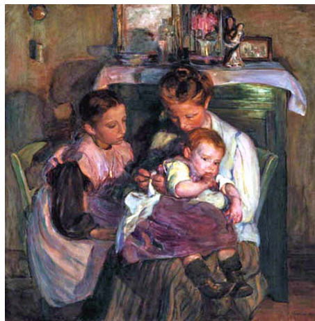
Figure 1. Nourse, Elizabeth. Happy Days , 1905. (Digital Image. Wikimedia Commons. Web. 28 Nov. 2013.)

Early in Nourse's career she gravitated toward the theme of females in caregiving situations, yet she did not depict wealthy women. (NMWA 49) She focused on working class women who were consumed by caring for children. One example of this was in Nourse's painting Happy Day (see Figure 1).