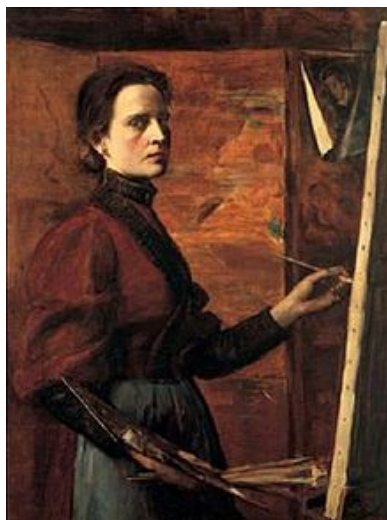
Figure 2. Nourse, Elizabeth. Self Portrait, 1892. (Digital Image. Wikimedia Commons. Web. 20 July 2013.)

In America, a group of women artists came together as activists seeking new rights for women. These women were all highly trained and successful artists who dedicated their lives to their art, foregoing the traditional path of marriage and caregiving. Dubbed the “New Women” artists, they were a group of about twenty women artists who at one point agreed to paint self-portraits depicting their strengths and dedication. The self-portraits reflected one side of their internal conflicts between desires for caregiving and self-expression. In her self-portrait, Nourse wanted the viewer to know the position she held and how important she was as a professional painter (see Figure 2).