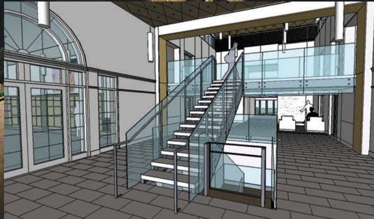
The old stairway in Northup Hall. From left, exterior during construction; central area that will include a light tower; artist's rendering of the light tower and main floor.