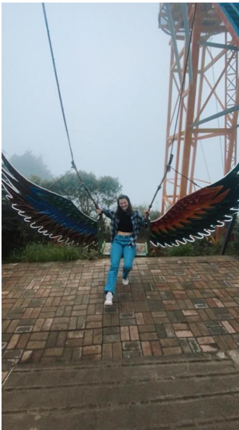
One of the many popular swings in Baños

The next day, we decided that we wanted to see Las Manos de Dios, which is a mountain ledge that is “supported” by the two hands of God. As we were traveling to this site, we also had the opportunity to see similar ledge sites, which had some very good photo opportunities! Along the way, I also had the opportunity to try rambutan, which is a traditional Asian fruit that has become very beloved in Ecuador; Originally, I was going to buy this fruit, but the vendor actually gave it to me for free, which made me very happy! Once arriving at Las manos de Dios, we actually didn’t end up going onto the ledge. Instead, we waited to go on this swing that rests near a canyon (for photographic reasons, of course!). However, we didn’t end up going on this either because a group of 4 people cut in front , and because of this, we ran out of time.