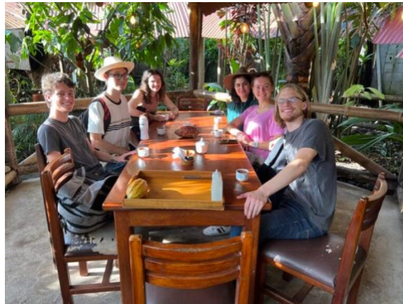
Us enjoying Yumbos

Our next (and final) day in Mindo consisted of doing horseback trails and hiking waterfalls! I was extremely excited about riding horses, since I hadn't been on a horse in at least 6 years. My horse, who was named Moro, was one of the most passive animals I think I've ever met; he just sat back and let the other horses, who were all dominant and wanted to be the "leader", take the lead. Even though I did enjoy horseback riding, I think my favorite part of the experience was the drive up to the horse ranch. We were taken up by a truck, which allowed us all to ride in the cargo bed. The 20-minute drive was very carefree, as we were just having simple conversations while enjoying the surreal scenery and light breeze of the wind. I can