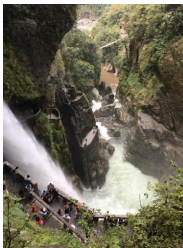
Cascada El Pailon