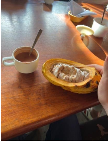
Yumbos Chocolate tour