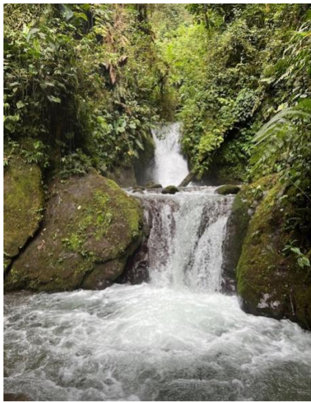
Another Mindo Waterfall

Now, onto Baños! The one thing I can say about this trip was that it was Chaotic! Thinking back, I definitely should've done more research on how to travel there (like I did for Mindo), but I do think my group and I still made the best of our experience. One thing I wish I had known before traveling was how spread out all of the activities are from the town-center of Baños. Due to the very long travel times, my group and I were only able to do two activities during our weekend getaway. In addition to the tourist system that is very potent in Baños, many