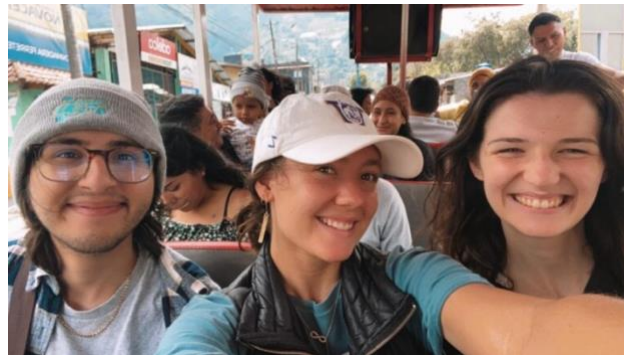
Us on the Baños “party” bus

When arriving at Baños, we decided our first task of the day would be to take a bus up to Casada El Pailón, which is a smaller hike that leads to a very popular waterfall. I absolutely loved this hike, as it was simple, but also contained some unique aspects. In order to get up close to the waterfall, we had to cross two wooden sky bridges, which looked over the tops of forest trees; I felt very close to nature during this whole process! Sadly, however, due to the time constraint we had on completing the hike and returning (40 minutes), we weren't able to finish it entirely, but we did get some awesome photos!