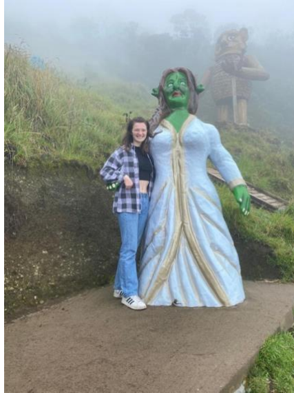
Ecuador REALLY loves Shrek lol