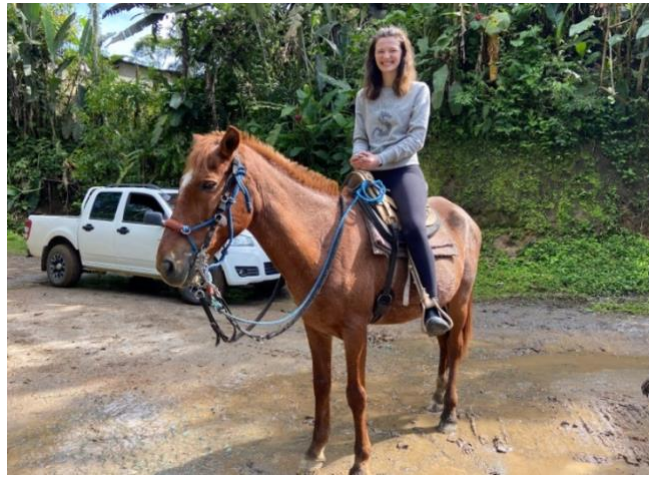
My new horse friend "Moro"

confidently say that this experience has made it into my core memories abroad! My only regret from this trip is not staying longer in Mindo!