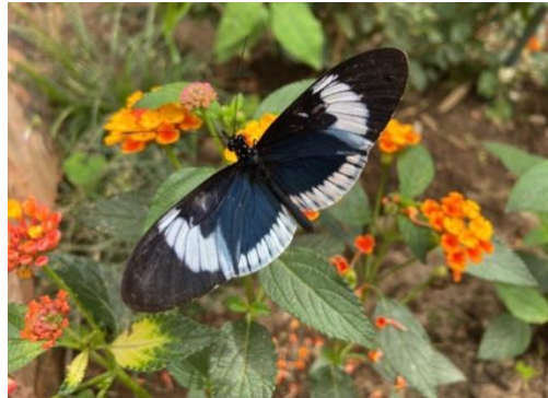
My favorite butterfly

butterflies I could attract were gigantic and moth-appearing. However, I felt very accomplished afterwards, which was the important part!