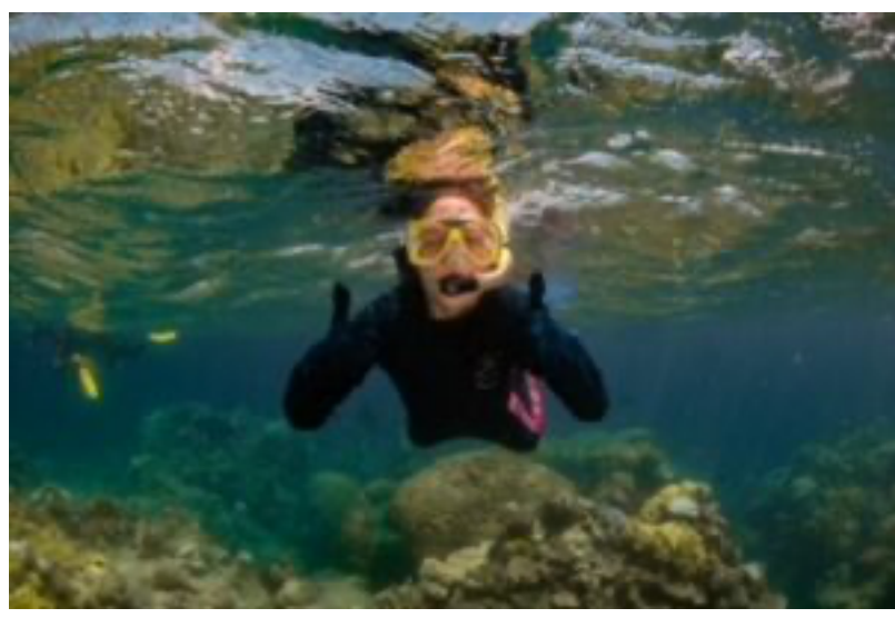
Snorkeling at the Great Barrier