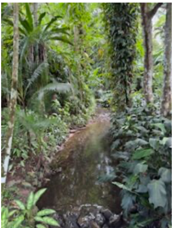
Cairns Botanical Garden

On Tuesday, I had a Great Barrier Reef snorkeling tour booked. The tour was amazing. We got picked up by the shuttle around 7am and were boarded the boat and headed towards the reef by 8am. The crew on the boat made it very enjoyable. We stopped at our first reef location for about two hours. The time flew by. I was in the water snorkeling the whole time. I got to see a lot of different fish and coral, and even a couple sharks at that location. Then we boarded the boat and headed to a second reef location. During this time, we were fed a delicious lunch by the crew. At the second spot, I again spent almost the whole time in the water snorkeling. I finally found a sea turtle and followed it around for at least 30 minutes. After that location we headed back to shore. It was a great day and an amazing experience.