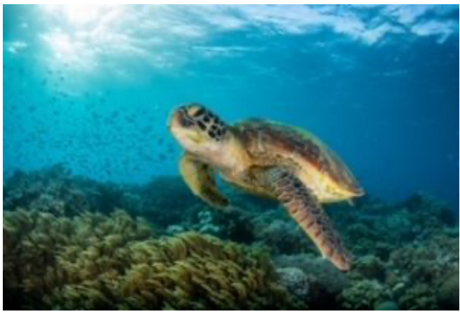
Sea turtle spotted at the Great Barrier Reef