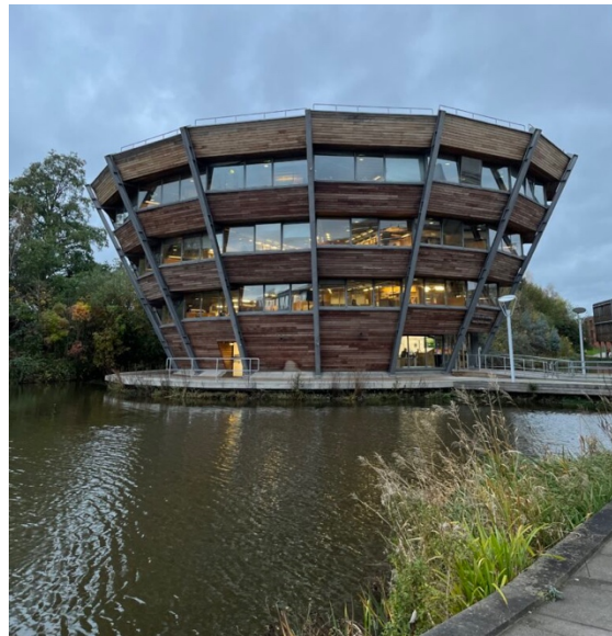
Djanogly Learning Resource Centre Library

Displayed is a brown wood and lots of glass -windowed bowl shape building with thin, steel, vertical beams. The building is surrounded by a small river of water with a small bridge to get to the building.