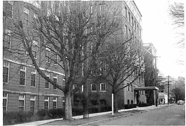
GOOD SAMARITAN HOSPITAL