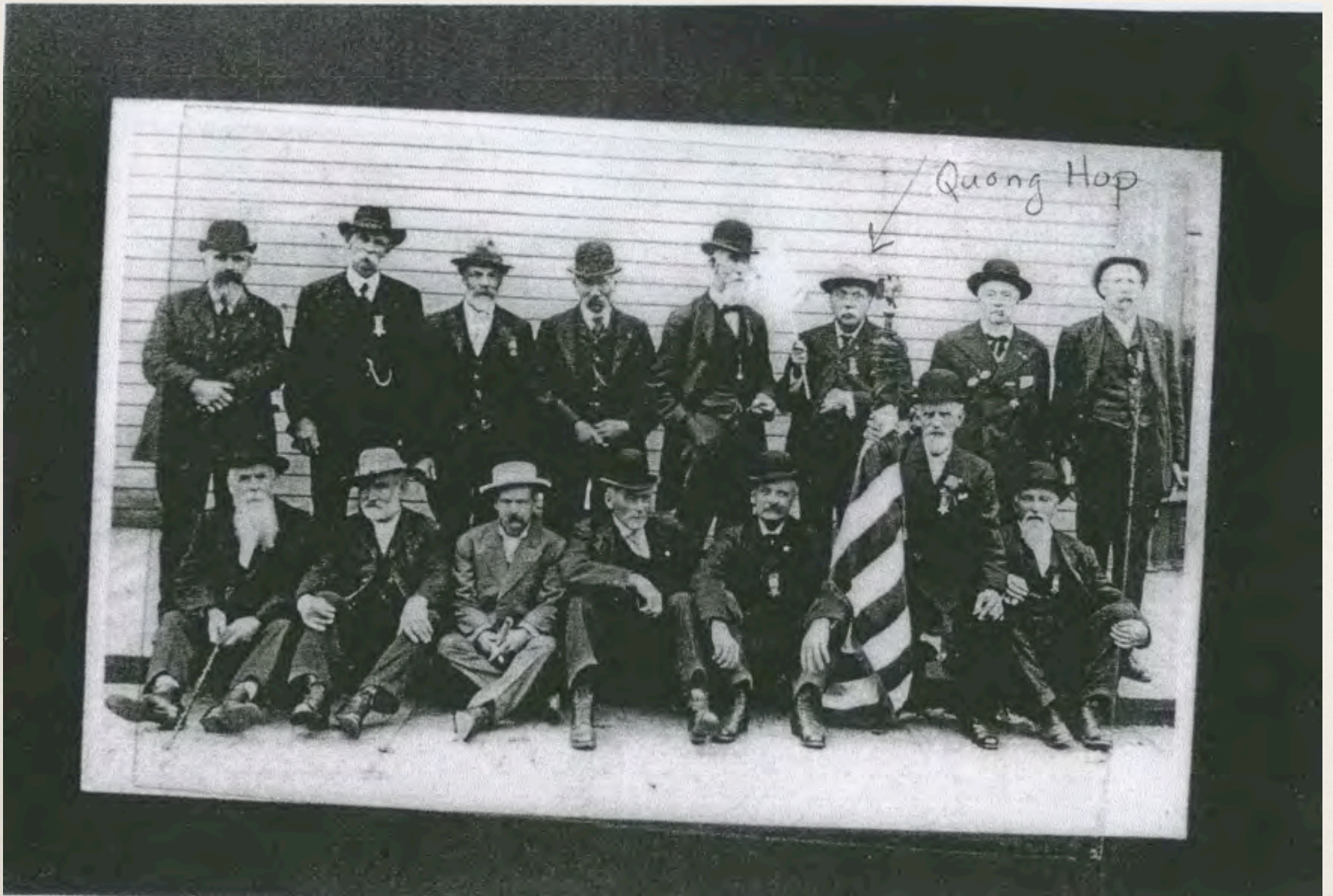
* Veterans of the Indian Wars