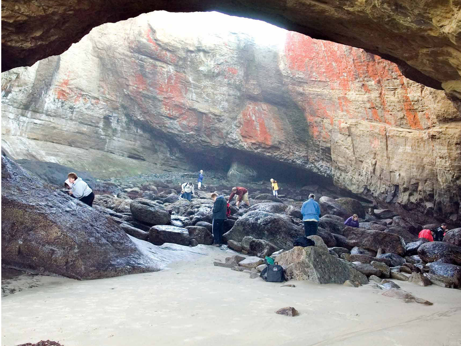
Students probe tide pools inside the ocean-worn sandstone walls of Devil's Punchbowl near Otter Rock during the DCE Shoreline Ecology course in Newport. Cavern walls are tinged with red algae, which thrive on spray from the churning water.