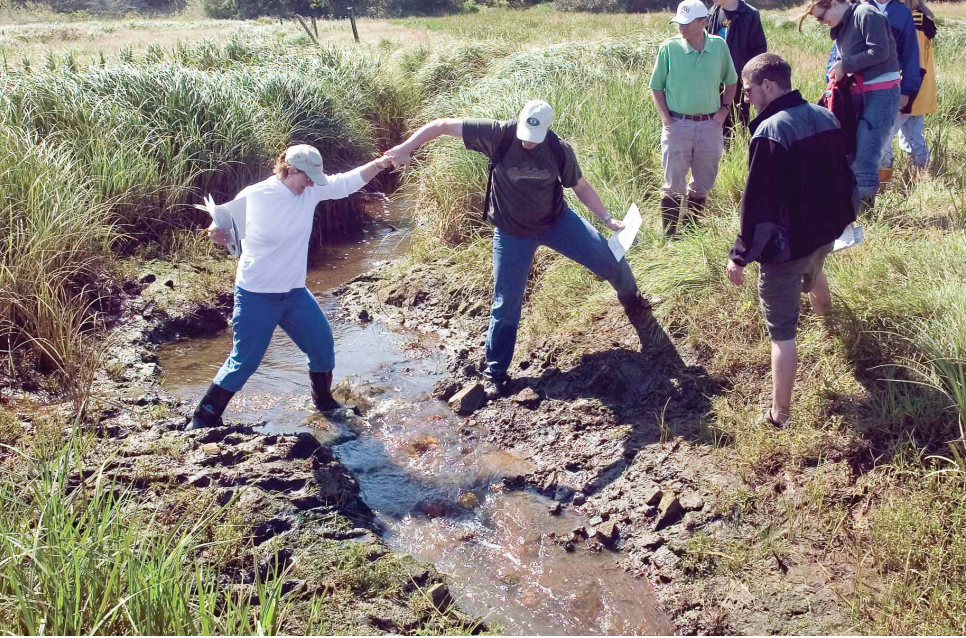
Students help each other through marshy terrain during a hike to view an estuary restoration project at the Siletz Bay National Wildlife Refuge.

species including chinook and coho salmon, cutthroat trout and a variety of marine fish.