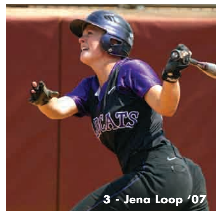
3 - Jena Loop '07