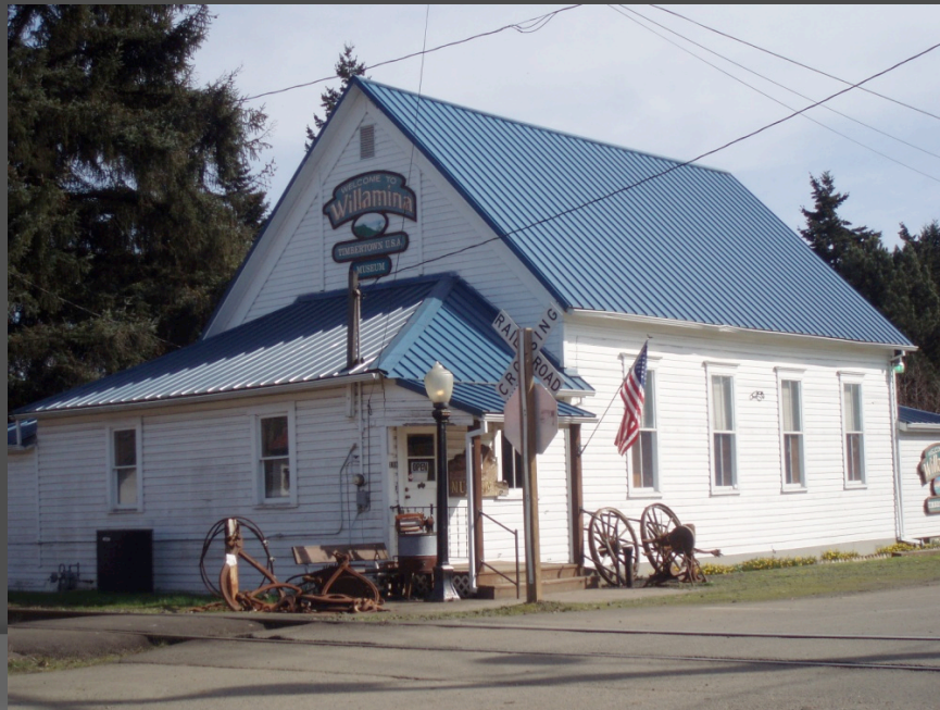
The Willamina Museum