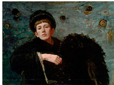
Figure 4. Ellen Day Hale. Self Portrait, 1885.

Like Elizabeth Nourse, Hale was part of the “New Women” artists of the late 1800’s, and she too painted a self-portrait (see Figure 4).